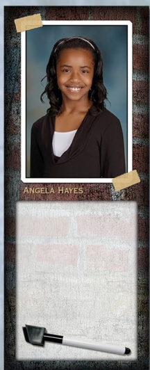
Dry Erase Locker Magnet