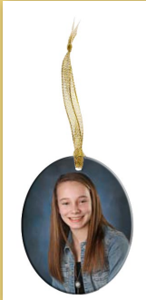
Oval Acrylic Ornament