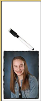
4 x 10 Locker Magnet