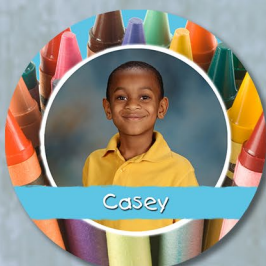
Button or Magnet