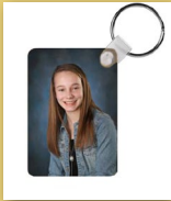
Metal Key Chain